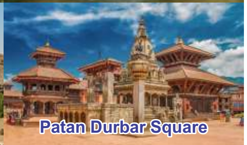
Patan Durbar Square