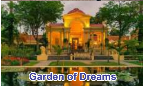
Garden of Dreams